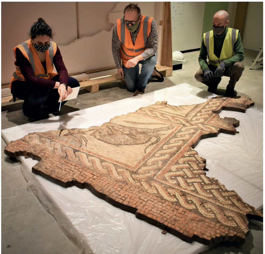
'The Dewlish Leopard and Gazelle Mosaic - saved for Dorset and the nation by the generosity of donors'.